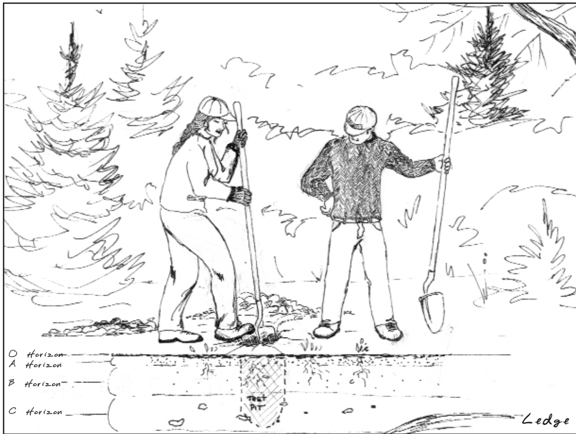
Cutaway view of soil test pit

decomposing leaves and other organic matter as well as small invertebrates and other organisms). Soil moisture and air spaces in the soil also factor in to the kinds of plant or tree life a certain location can support.