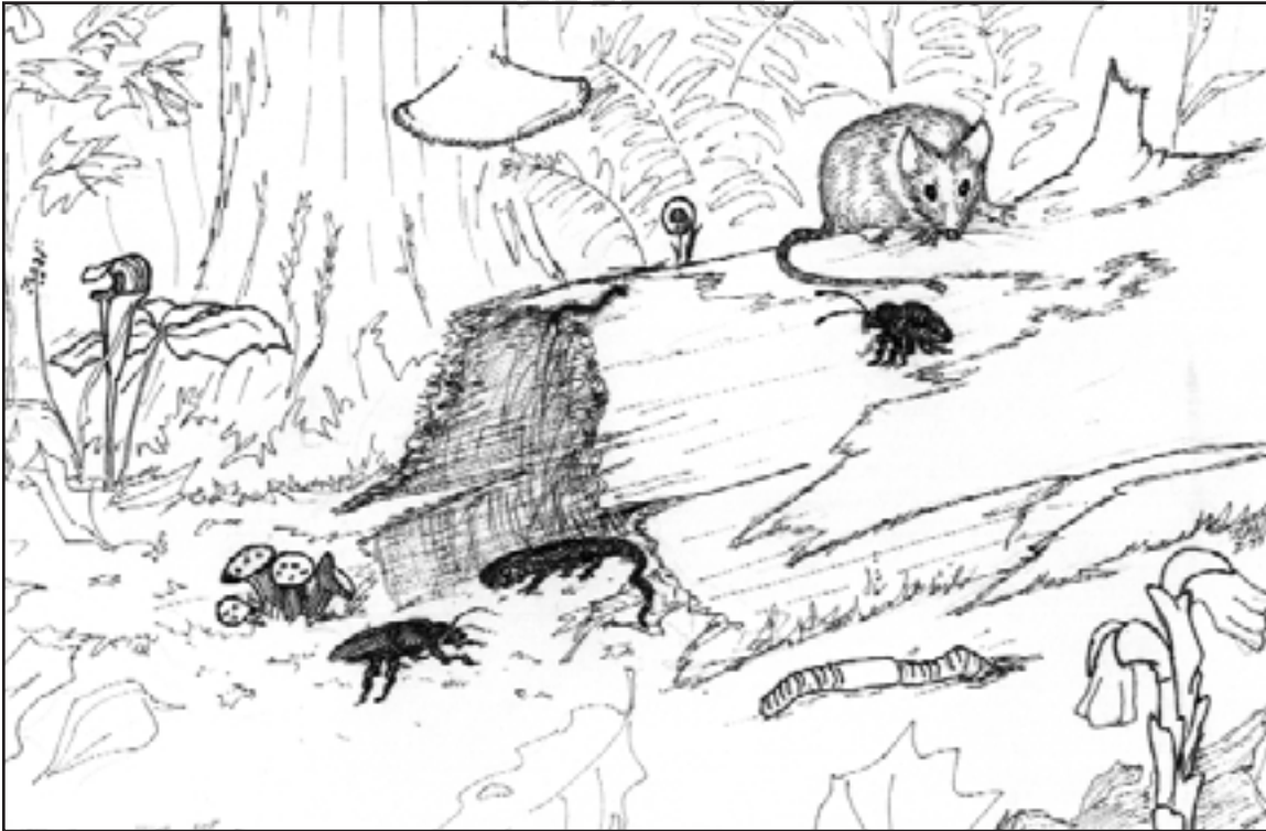
Leaf Litter - Forest Floor - Soil Critters

How many forest floor critters can you locate?